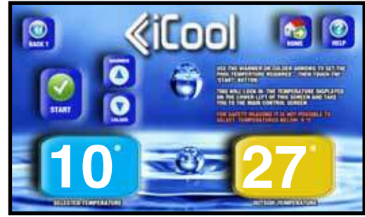
Temperature Selection Screen

The Main Operating Screen (above left) appears when you touch the WELCOME screen. It provides many options which are covered in detail later in this manual,