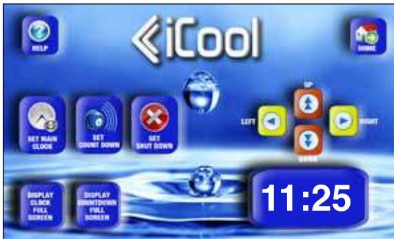
Clock Control Screen

Your iCool offers a number of very useful timing functions including a real-time clock, a countdown timer to time your recovery and training sessions and a timer to shut down the system automatically after use. To set up and use these functions touch the “ Timer ” button on the HOME screen.