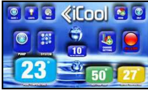
Main Operating Screen