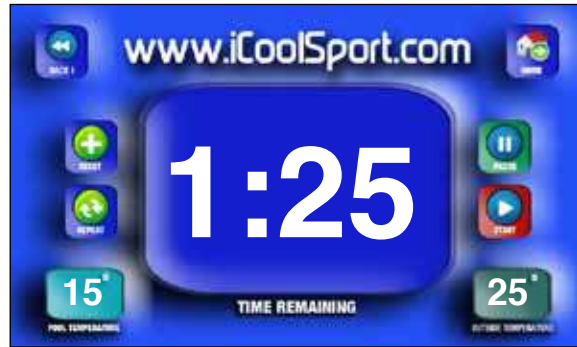
Session Timer Screen